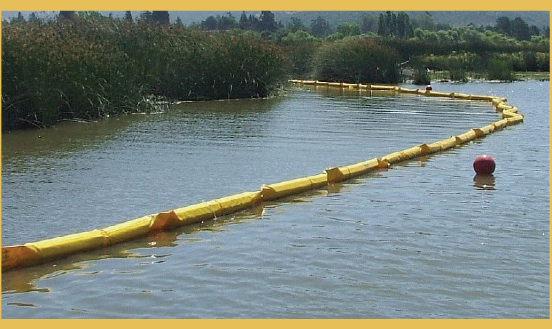
Turbidity Curtain Prevents Sediments From Migrating Away From Site