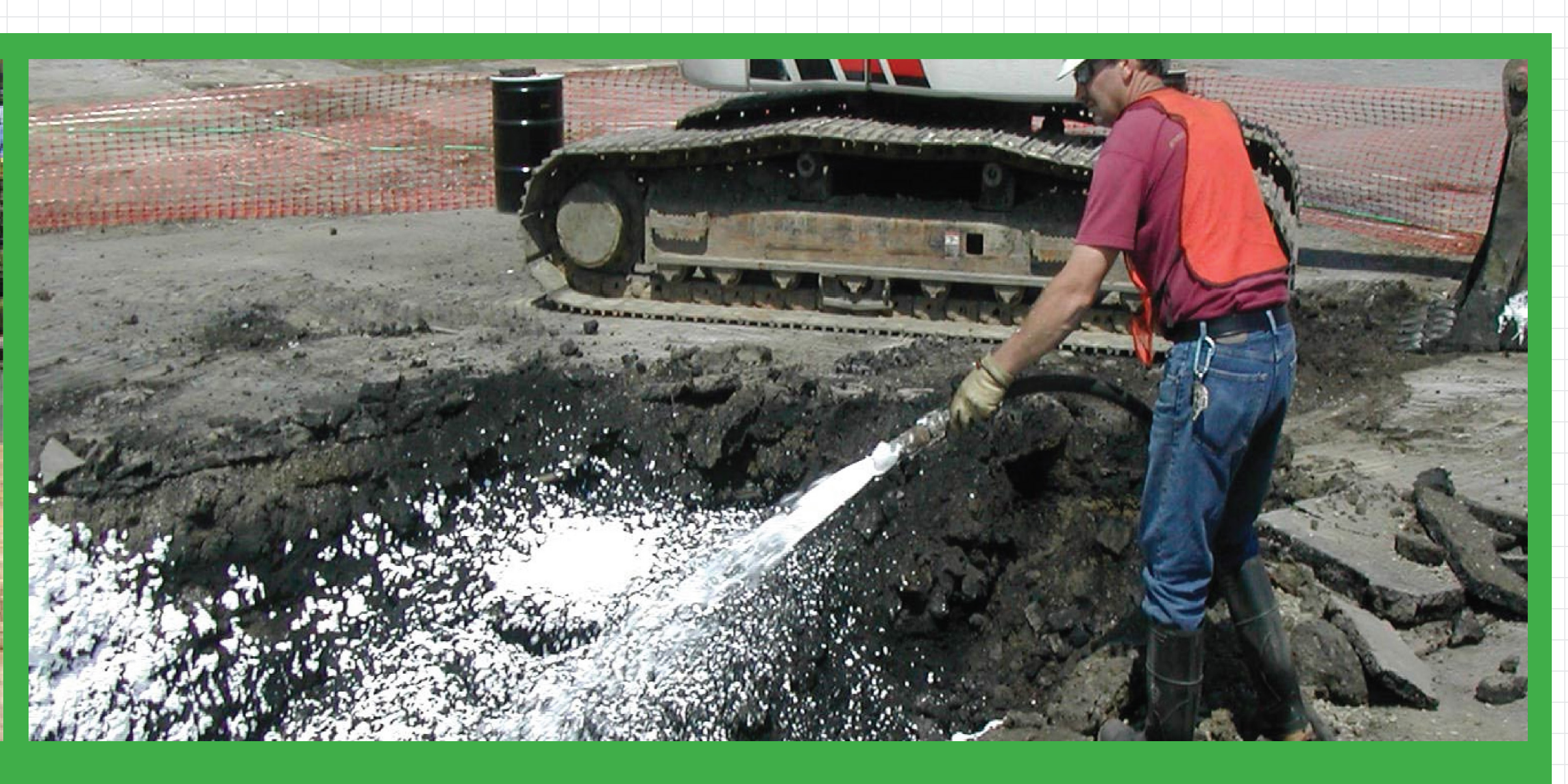
Foam Addresses Any Odors