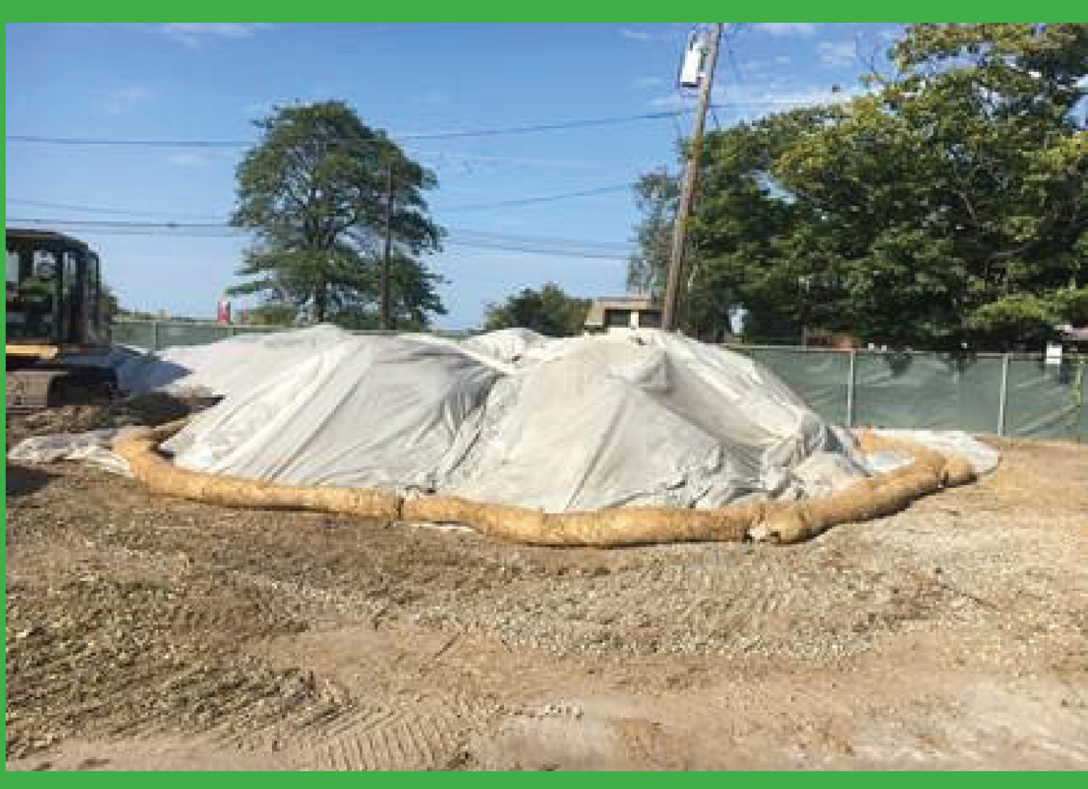
Covered Stockpiles Control Dust and Odors